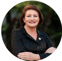
Toni Atkins, State Senate District 39 →